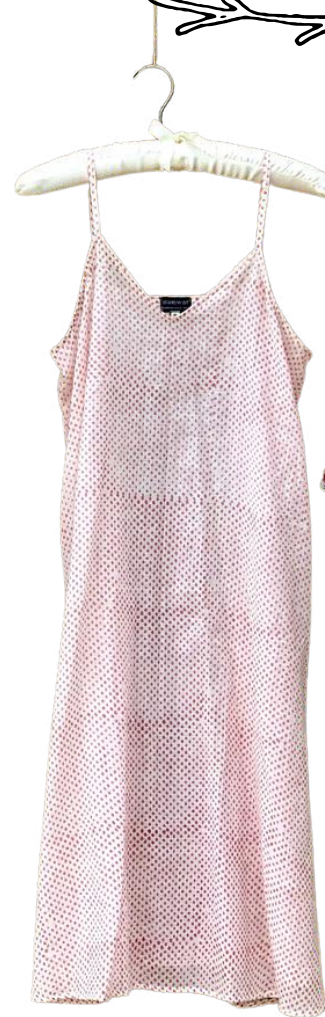
JANE SLIP RAIN DROPS, Dusty Pink Cotton Wholesale : $118 Retail : 265