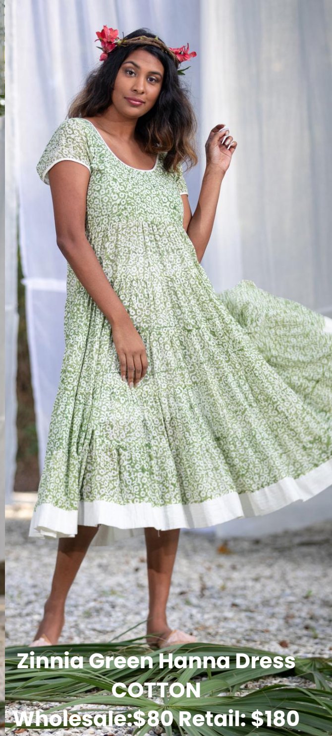
Zinnia Green Hanna Dress COTTON Wholesale: $80 Retail: $180