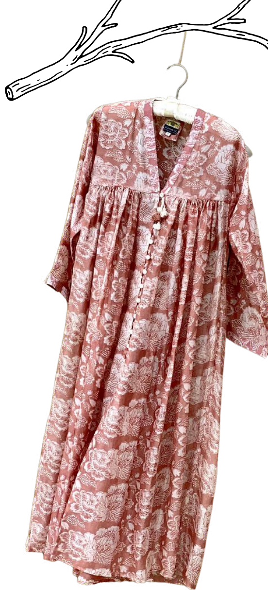
AKIRI DRESS Cabbage Rose, Dusty Pink SILK Cotton Wholesale : $98 Retail : $220