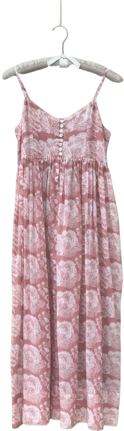
FELICIA DRESS Cabbage Rose, Dusty Pink Cotton Wholesale : $70 Retail : $158