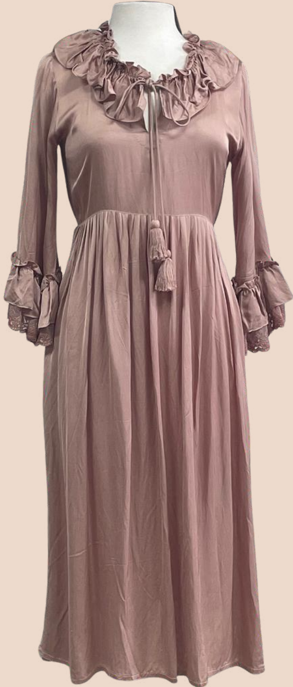
SYLVIE DRESS, Long Parchment Modal Satin Wholesale : $120 Retail : $270