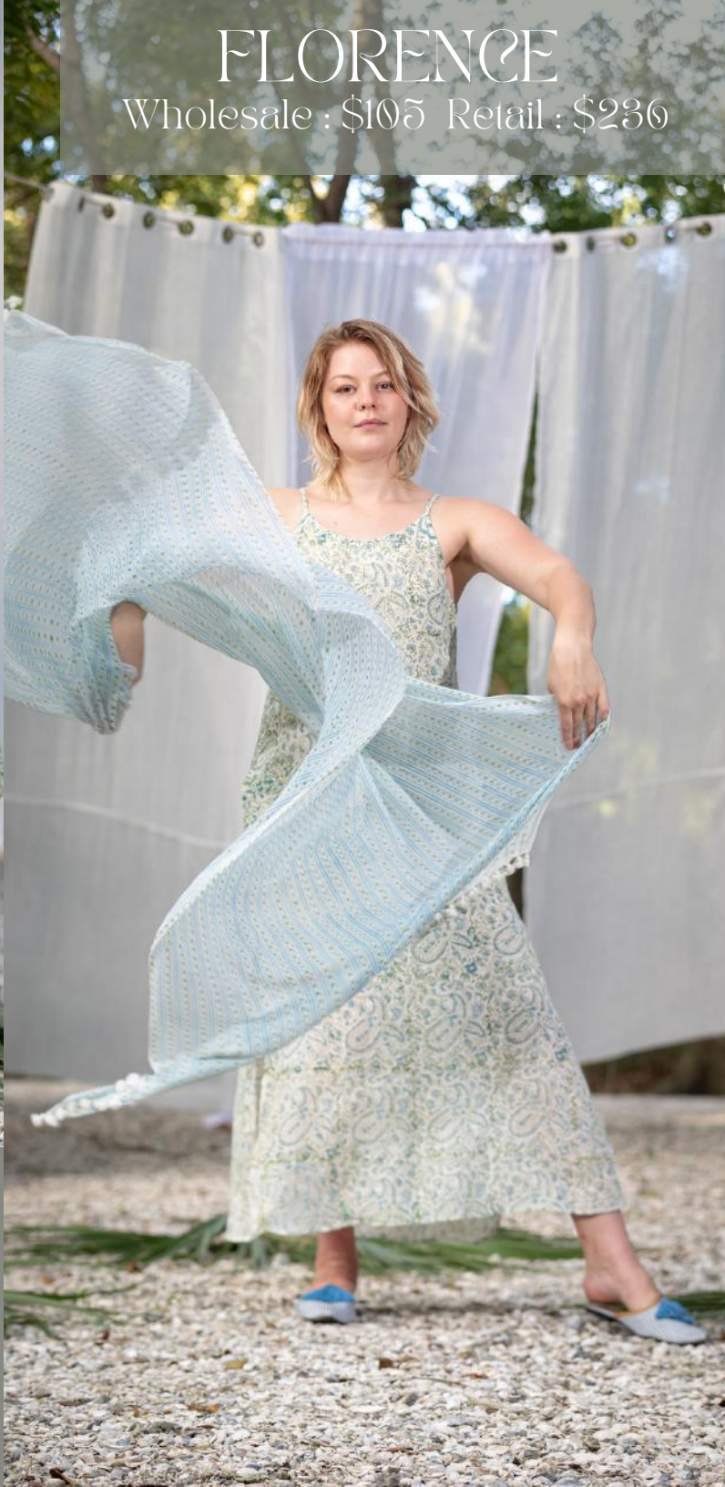
FLORENCE Wholesale : $105 Retail : $236