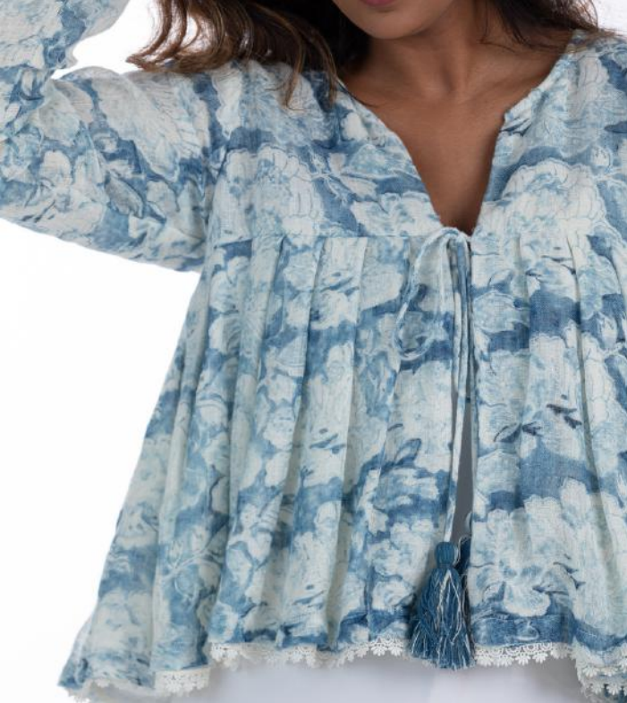
Junoon Jacket JUNOON JACKET in Indigo Cabbage Rose Printed Sheer Linen is lined and has lace trim Wholesale : $120 Retail : $270