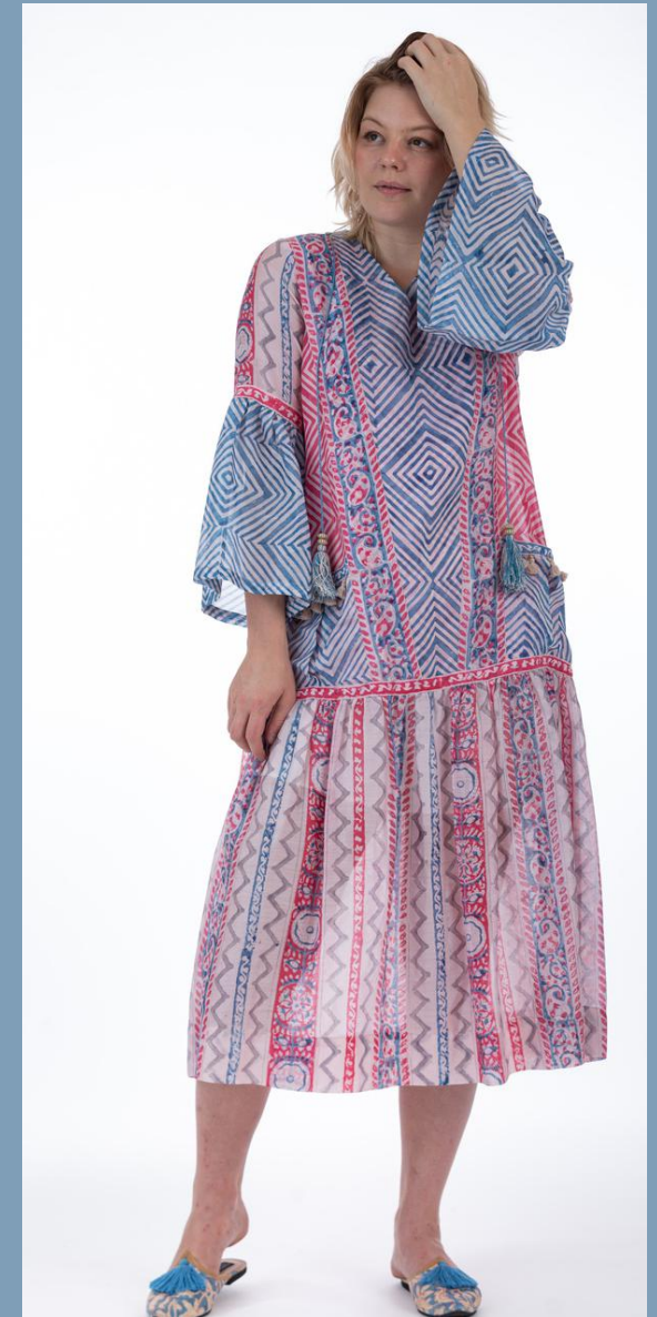
DROP WAIST DRESS Pink and Blue Hand Block Printed Silk Cotton Wholesale : $138 Retail : $310