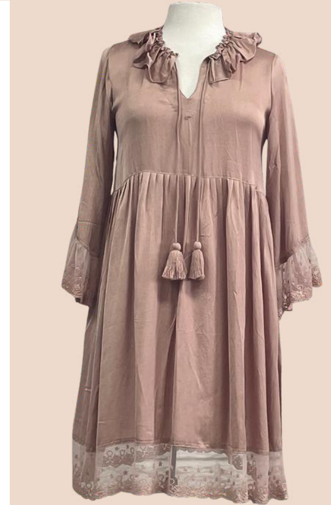
SYLVIE DRESS, Knee Length Parchment Modal Satin Wholesale : $110 Retail : $248