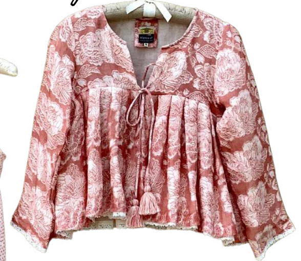
JUNOON JACKET Cabbage Rose, Dusty Pink Gauze Linen Wholesale : $120 Retail : $270