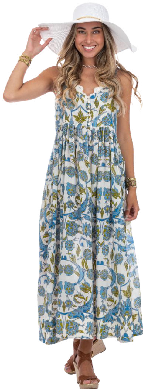
FELICIA Dress Jamewar Blue/Green COTTON Wholesale $70 : $Retail $158