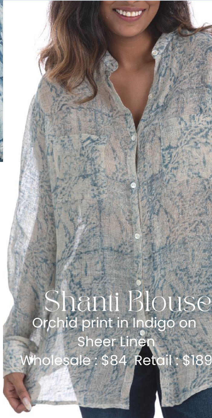
Shanti Blouse Orchid print in Indigo on Sheer Linen Wholesale : $84 Retail : $189