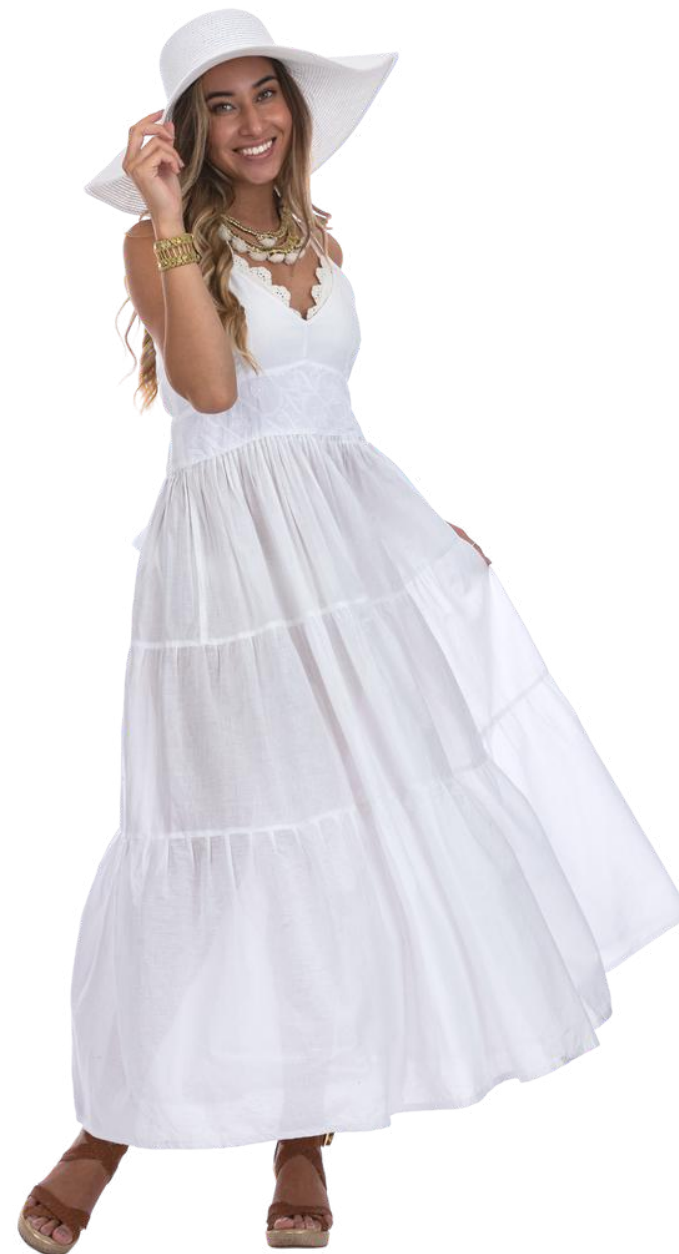
Camilla Dress Available in White Cotton and Shell Silk Cotton Wholesale :$75 $Retail : $168